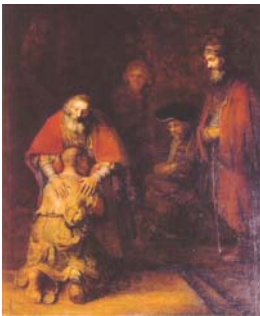
Rembrandt, The Return of the Prodigal Son , c. 1669

A few years before he died, Henri Nouwen wrote a book called The Return of the Prodigal Son . Henri was captivated by the painting of his fellow Dutchman Rembrandt depicting a scene from Jesus' famous parable (see Luke 15:11-32). By the time he wrote the book he had given up his career of teaching spirituality at Yale and Harvard and settled into the Daybreak community for physically and mentally challenged adults in Toronto. Henri saw himself as the prodigal in need of the father's love and acceptance – not because he had led a conspicuously dissolute life, but because his outwardly successful life as a writer and teacher was full of so much inner turmoil.